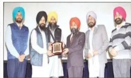
ਸੈਮੀਨਾਰ ਮੇਂ ਪ੍ਰਵਕਤਾਓ ਕੌ ਸਮਾਨਿਤ ਕਰਤੇ ਕਾਲੇਜ ਪ੍ਰਬੰਧਕ।